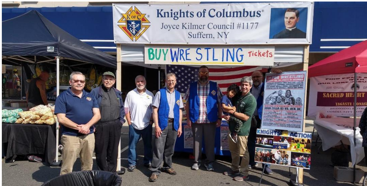
The Knights of Columbus, Joyce Kilmer Lodge, has been supporting the parish for a great many years. Representatives manned the booth for the street fair. The K of C raises money by organizing different activities such as the wrestling match they are currently sponsoring.