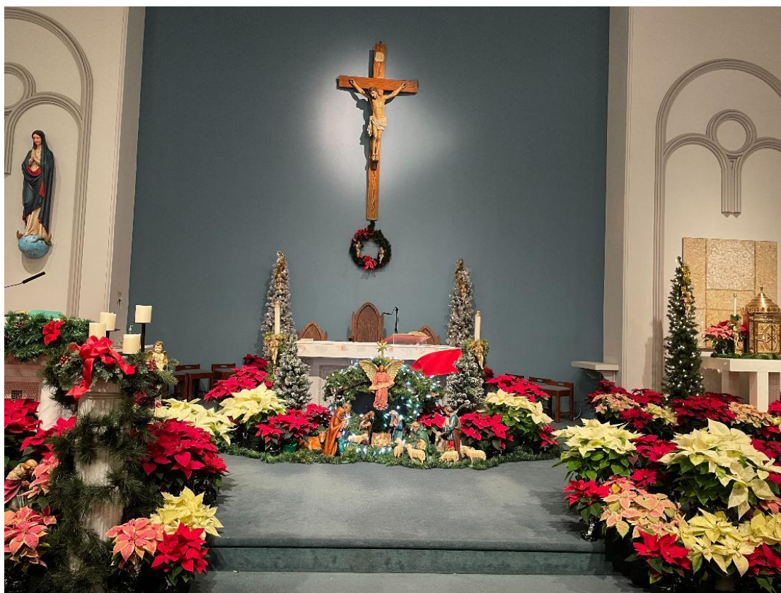
"O Holy Night": The sanctuary of Sacred Heart Church, transformed for Midnight Mass on Christmas Eve. As usual, parishioners were generous in donating to the Christmas flower collection, assuring an abundance of poinsettias to celebrate the Christmas Season, 2021.

Lots of presents. With many families still struggling to make ends meet, parishioners were more generous than ever in donating gifts for children this Christmas. Instead of the traditional Christmas party, gifts were given out as families were leaving Mass on Dec. 18 and 24. A great many more gifts were distributed to the Sisters of Life in Manhattan, Good Counsel Homes in Nanuet, and the Willows at Ramapo Rehabilitation and Nursing Home in Suffern.