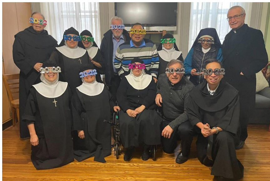
Holy Innocents? Friars and Sisters still have a bit of fun in the tradition of Holy Innocents' Day as they look forward to the New Year, 2022.

Due to the continuing Covid restrictions the parish staff Christmas party as well as the SAR Epiphany party were cancelled. On the positive side, the first volume of the new SAR manual in English entitled Let Us Begin! has been received and will be distributed to the Tagaste fraternity members as soon as we can safely schedule a meeting.