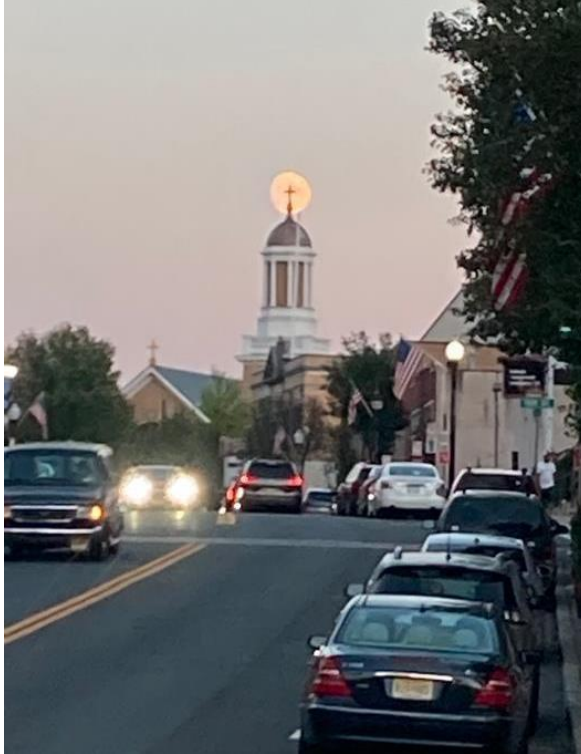
Light of Christ! Photo of the moon perfectly framing the cross over the cupula at Sacred Heart Church on the evening of September 18.