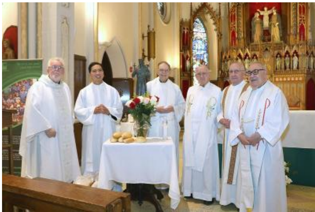
Distribution of St. Nicholas bread to the faithful following the Mass.