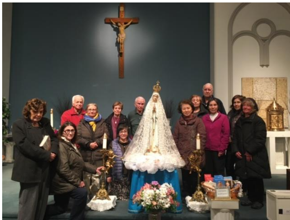
Honoring Our Lady. The Immaculate Heart of Mary prayer group of Sacred Heart met on March 30 to pray before the pilgrim statue of Our Lady of Fatima.

CONGRATULATIONS TO OUR NEWLY-ELECTED PRIOR GENERAL OF THE ORDER OF AUGUSTINIAN RECOLLECTS!