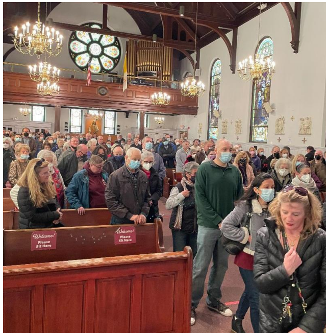
Parishioners move forward to receive ashes at one of the Ash Wednesday services at Sacred Heart on March 2, 2022.